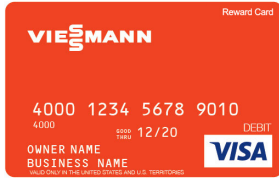
Viessmann Visa® Prepaid card