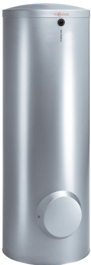
Vitocell-V 300 Convenient, durable, hygienic