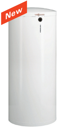
Vitocell 300-W, EVIA New smaller size and color to match wall-mounted boilers