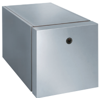
Vitocell-H 300 Compact and "stackable"