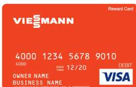
Viessmann Visa® Prepaid card