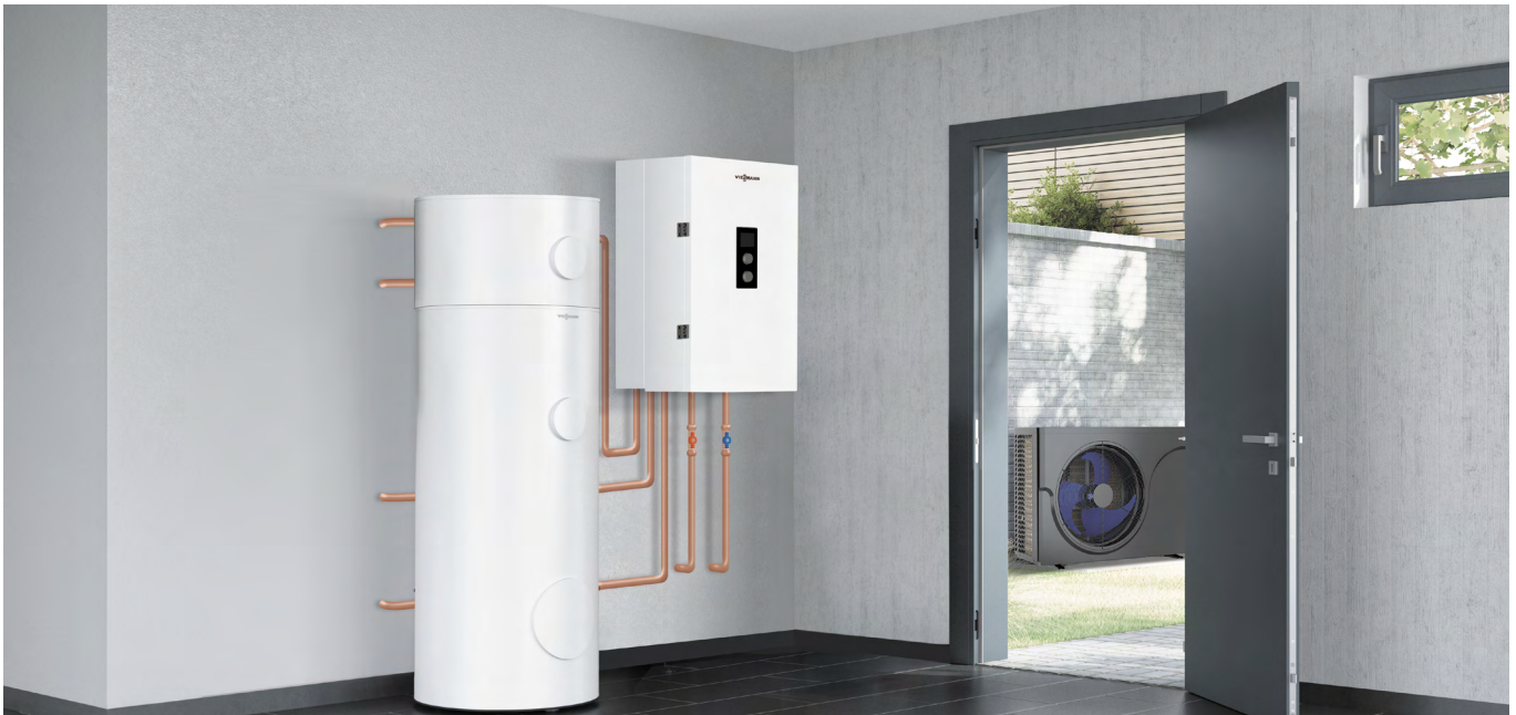
The Vitocal 100-AW offers a complete solution for residential applications. The optional domestic indirect tanks are available in three sizes, 53, 66 or 79 gallons.

▶ The Vitocal 100-AW is a true all-in-one kit with indoor unit, outdoor unit, and buffer tank. The easiest way to add heat pump hot water. ▶