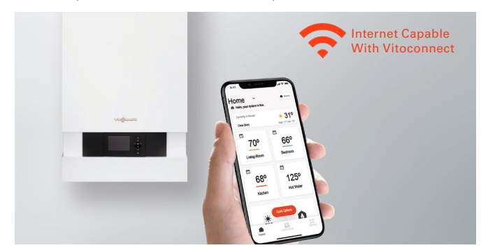
Always be in control with Viessmann's Digital Solutions

You're always in control with the ViCare App. As part of Viessmann's Digital Solutions, ViCare allows you to remotely control your Vitodens 200, B2HA, anywhere from your smartphone or tablet (when used with Vitoconnect).