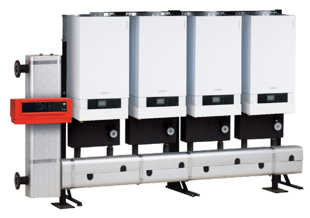
Up to 8 Vitodens 200, B2HA units can be cascaded for inputs up to 4240 MBH