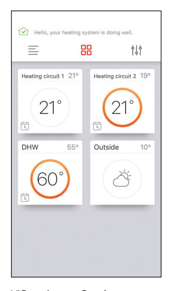
ViCare App — Comfort at a glance. Program your boiler for ideal temperature and maximum cost savings.