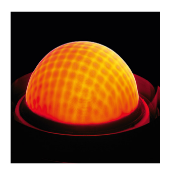
The MatriX dome burner for exceptionally low-emission combustion; a milestone in heating technology.