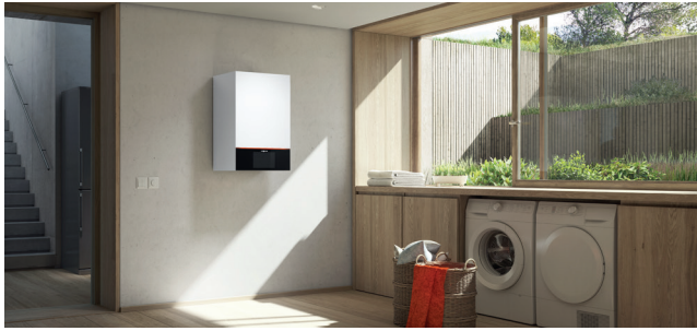
The Vitodens 200-W, B2HE offers the best value in its class with new industry-leading technology and the most standard features.

The industry's first intelligent combustion management system offering the highest levels of performance, reliability, and comfort.