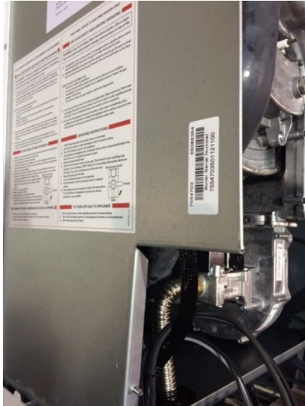
Figure 3: Location of serial number under the white cover