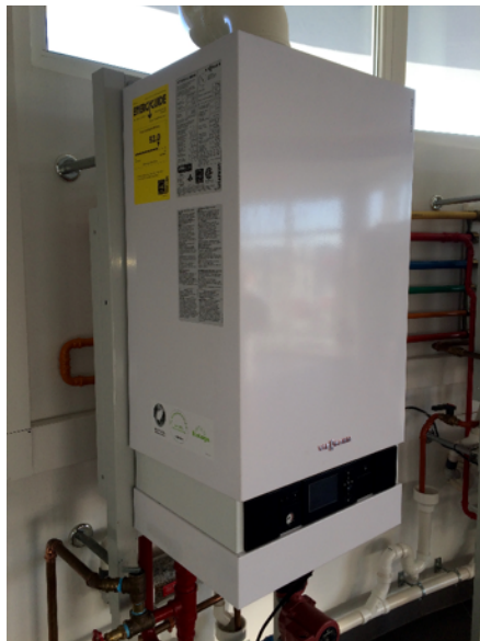
Figure 1: Vitodens 200-W Series Boiler