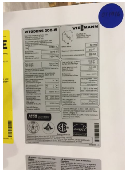
Figure 2: Boiler with a blue dot and handwritten data label on the blue dot