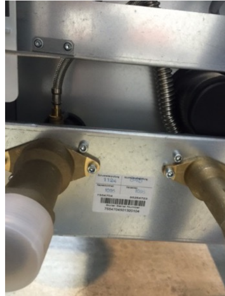
Figure 4: Location of serial number under the boiler

Vitodens 200-W Boiler Models Affected: • B2HB 45 • B2HB 57