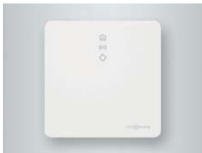
Vitoconnect OPTO2 with connections for the power supply adaptor and data connection via USB.