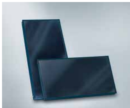
Vitosol 200-FM with switching absorber coating ThermProtect

The temperature-dependent shutdown of these two collectors is entirely independent of system configuration and control unit settings. Solar thermal systems are, therefore, completely fail-safe. The thermal loads on system components and the heat transfer medium always stay within their normal range. This increases service life and operational reliability compared to conventional solar thermal systems. In addition to robust operation, collectors with temperature-dependent shutdown are also more tolerant of incorrect sizing.