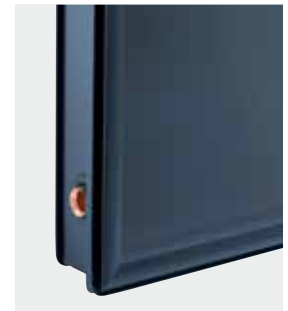
Collector frame with special roof integration profile for fitting the covering frame

The flat-plate collectors are universally suitable for on-roof installation, roof integration and freestanding installation in locations such as flat roofs. The easy-to-install Viessmann fixing system comprises structurally tested, corrosion-resistant components made of stainless steel and aluminum.