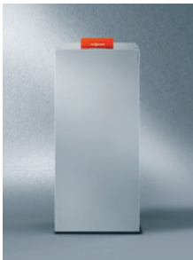
Vitocrossal 300, CU3A gas-fired condensing boiler