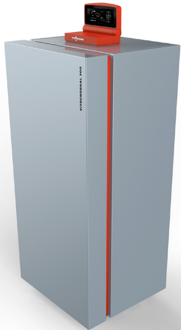
Vitocrossal 300, CU3A

The Vitotronic Boiler and System Control arrives preset with the basic factory-set parameters to handle most applications. Site specific adjustments, such as time, date and language, can be set up during the initial set-up wizard when the unit is first turned on. If you've forgotten to connect an outdoor sensor or domestic hot water sensor, the control will let you know, in plain text.